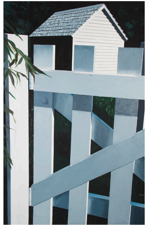
At Sands Point #47 , 1985 oil on canvas 84 x 60 inches