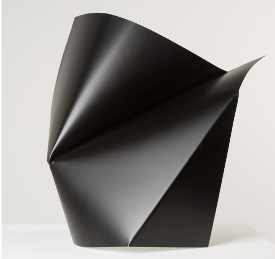
Black Fold , 2014, hand folded aluminum and paint, 16 ½ x 29 x 27 ½ in.

Contact: Locks Gallery T 215-629-1000/F 215-629-3868 info@locksgallery.com