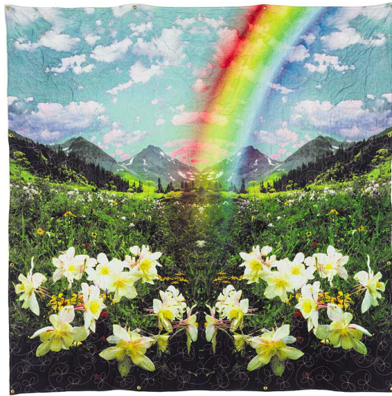
Fig. 4 Untitled (Mountain Meadow) , 2001, digital dye print on canvas, crushed velvet, quilting, and grommets, 87 x 87 inches