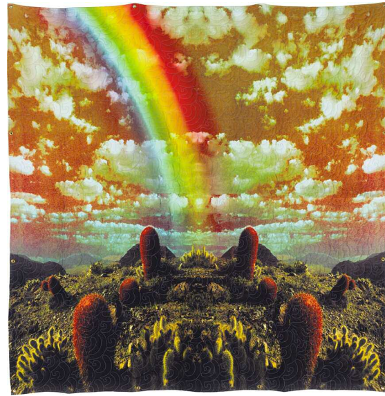
Fig. 5 Untitled (Desert) , 2001, digital dye print on canvas, crushed velvet, quilting, and grommets, 87 x 87 inches

display the Keats' masks side-by-side in a nod to Thek's Technological Reliquaries . He propped the life mask at the center of one of his decadently upholstered ottomans, for which he appropriated a six-pointed star, common in traditional quilt design. He scaled up the star and pieced it together from crushed velvets and rabbit skins dyed electric colors and radiating from the head of Keats (he also died prematurely, at 25 from tuberculosis). Marti rested the death mask on a pillow floating in a gnarled tangle of cast aluminum grape vines that evokes a flaming funeral pyre (fig. 3). These works position Keats as a kind of forefather to the 1960s aesthetic (both the Romantics and the hippies were looking to commune with nature) and his spirit seems to ripple through Forest Park .