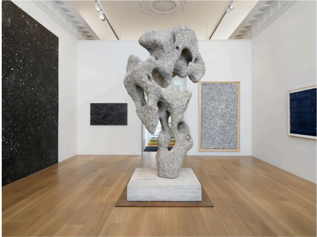
Installation view of “Visible Traces (Mountain Water Air)” at Lévy Gorvy, New York, 2019, curated by Pat Steir.

Steir is often asked to describe how she makes her art. In a film about her work released a few months ago, she reiterated how, “My idea was not to touch the canvas, not to paint, but to pour the paint and let the paint itself make the picture.” Consequently, there are days when she enters her studio in an industrial space in Chelsea overlooking the Hudson River and is surprised by how her work looks after it has dried. Even though she knows something like this will happen, it’s never the same “because,” she recently told me, “different pigments have different weights.” “The paint,” she pointed out, “changes while it moves.” In the end, “It’s gravity that makes the image.”