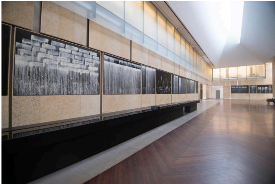
Installation view of "Pat Steir Silent Waterfalls: The Barnes Series," 2019, at the Barnes Foundation, Philadelphia.

© 2019 ARTNEWS MEDIA, LLC. ALL RIGHTS RESERVED. ARTNEWS® IS REGISTERED IN THE U.S. PATENT AND TRADEMARK OFFICE.