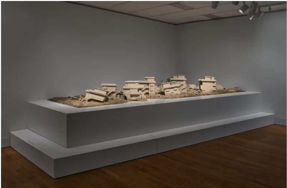
Juree Kim’s “Evanescent Landscape – Hwigyeong: Philadelphia” (2023), soil and water. The work is part of the Philadelphia Museum of Art’s exhibit “The Shape of Time: Korean Art After 1989.”

Other works are meant to fall apart over the course of the run. Juree Kim used unfired clay to build a small city in Evanescent Landscape — Hwigyeong: Philadelphia . Museum staff will pour water on the artwork periodically so the meticulously crafted houses will disintegrate and crumble, drawing a connection between the gentrifying cities of Seoul (Hwigyeong-dong is one neighborhood there) and Philadelphia.