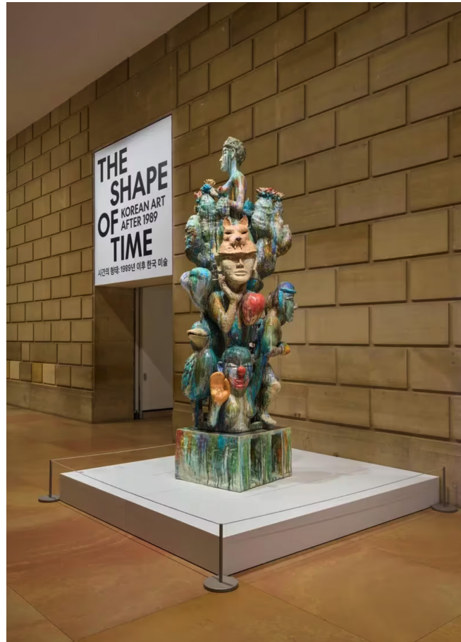
Sunkoo Yuh's "Monument for Parents" at the Philadelphia Museum of Art's "The Shape of Time: Korean Art after 1989," running through Feb. 11, 2024.

The nearly 12-foot-tall sculpture sits at the entrance to the Philadelphia Museum of Art's show, "The Shape of Time: Korean Art After 1989," running through Feb. 11, 2024. Yuh is one of 28 artists in the major exhibit.