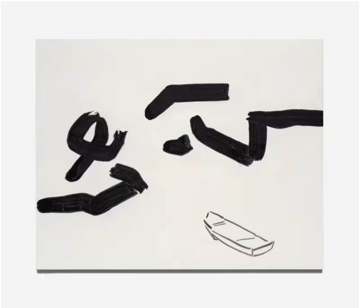
Lee Kang So's "The Wind Blows-230333," 2023, acrylic on canvas, was part of the exhibit "Wind / Flow" at Locks Gallery.

While clay dates back to prehistoric times, Temple Contemporary's exhibit "Decorative Digitalism," running through Feb. 3, 2024, highlights the latest digital technologies. A collaboration with Kookmin University in Seoul, the show features 13 artists presenting 3-D printed pieces and silver works that bridge jewelry and sculpture.