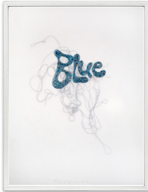
Rob Wynne, Blue , 209, glass beads and thread on vellum, 27 x 21 inches

Since the 1990's, Rob Wynne has created his signature glass wall reliefs composed of individual hand poured, mirrored glass elements. "A ladle of molten glass slipped out of my hand and spilled onto the floor, making a huge splat ... it was a kind of cosmic explosion ... that led me to realize I that I could actually control it and start making actual letters out of it," recalled the artist. Each glass piece is made in a labor-intensive, multi-step process of blowing, pouring, and cooling. The resulting glimmering, seductive, irregularly shaped compositions suggest a personal touch that is absent in other text works such as those by Jenny Holzer or Barbara Kruger. Both in materiality and subject matter, Wynne's glass and mixed media works demonstrate his mastery of contradiction.