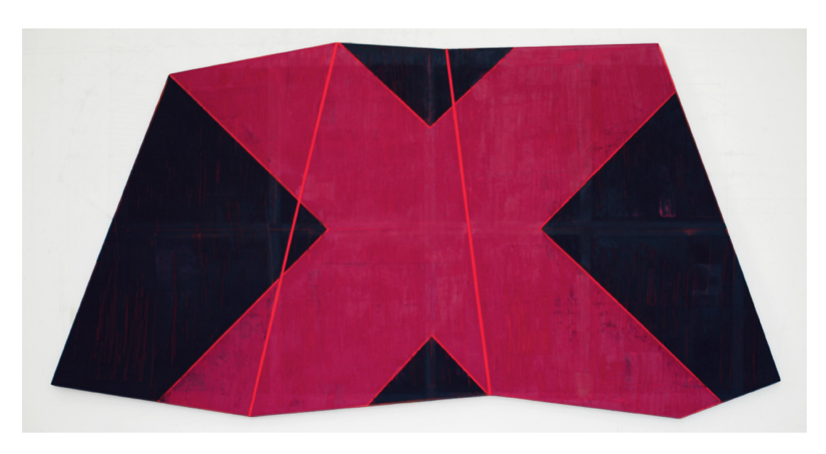
Big Pink, 2017, oil on canvas, three panels, 50 1/2 x 72 inches

In dialogue with the trajectory of abstract painting in New York, including artists such as Frank Stella and Robert Mangold, Row breaks down the elemental language of abstraction and traditional components of painterly syntax, combining ideas from the modern tradition with the burgeoning influence of semiotics in the 1980s.