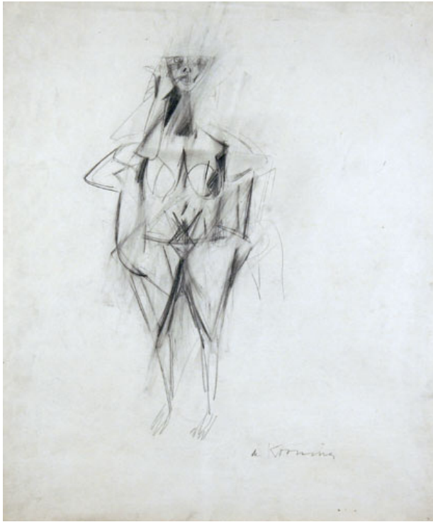
Willem de Kooning, Study for Marilyn Monroe , 1953, 15 x 14 3/4 inches.

The young, Brooklyn-based artist Chloe Piene has been making diaphanous charcoal drawings of naked figures on paper and vellum based mostly on photographs of herself and, occasionally, other people since the late 1990s. The frenzied yet controlled energy of the lines in her drawings is evidence of their performative character. They are executed rapidly, or in Piene's words, "it comes out in one shot." Piene's agitated style of drawing is a strangely alluring complement to her unsettling imagery, which often imbues its autoeroticism with Vanitas-type morbidity. Piene sees her work as riding the line "between the erotic and the forensic." Unlike de Kooning's drawings, which relocate the Self in the Other, Piene's inscribe the Other in the Self. Her drawings are of her