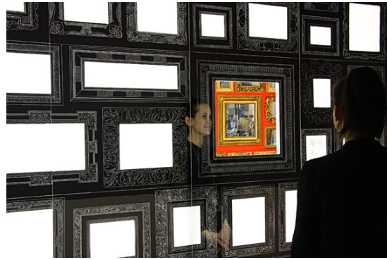
detail, Collection of Impossible Subjects , 2008, rear-illuminated hand-engraved Plexiglas mirrors in aluminum frame, 8 x 12 feet

Gallery Hours: Tuesday–Saturday, 10am–6pm