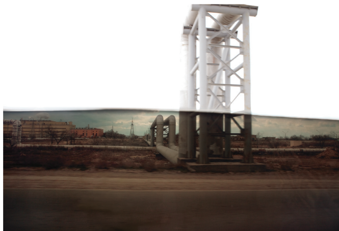
Simon Lee, Fence, 2009, inkjet print on archival etching paper, 47 x 66 inches