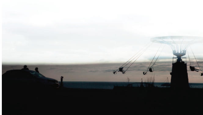
Simon Lee, Carousel, 2009, inkjet print on archival etching paper, 47 x 66 inches