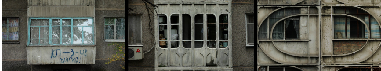
Simon Lee | Eve Sussman, Wintergarden, 2011, 3 channel HD video, 36:00 minutes