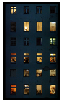
Simon Lee | Eve Sussman, Seitenflügel (video stills), 2012, single channel HD video, 28 minutes