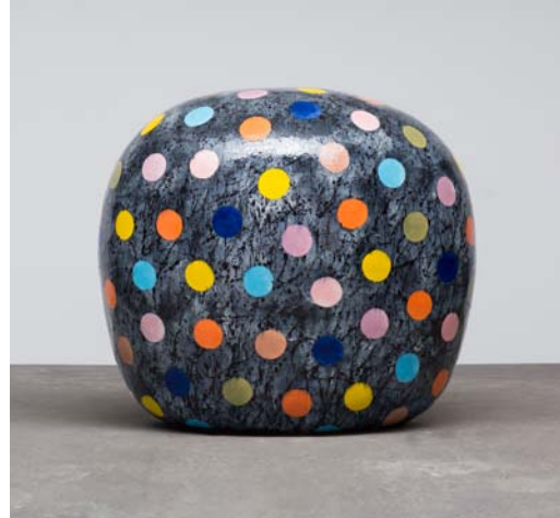
Untitled Dango (13-12-01) , 2013, glazed ceramic, 31.5 x 44.75 x 33.75 inches

Locks Gallery is pleased to present an exhibition of ceramic works by the artist Jun Kaneko alongside video excerpts of the artist's opera design for Wolfgang Amadeus Mozart's The Magic Flute . Stemming from his ongoing concerns regarding spatial relationships and installation, Kaneko has fluidly moved between his sculpture and theater practice. The late art critic Arthur C. Danto applauded Kaneko's previous opera design (for Madama Butterfly ) stating that, "The production unfolds like a shared dream."