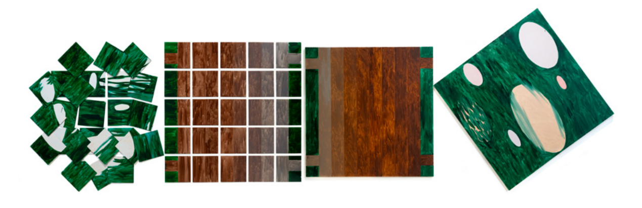
Swimmers and Rafts, Jumble, 1979, enamel over silkscreen grid on fifty baked enamel steel plates and oi on canvas, two panels, 81 1/2 x 262 inches

in the world, not even oneself, only the life-giving ocean, from which Venus, the life-giving goddess of love, is born. She is the permanently young, eternally virginal mother in the mind of the infant, totally dependent on her for his life. He is symbolized by the infantile Cupid, and later the infant Christ, also mystically conceived, also mysteriously born of a virginal mother. They are the ideal couple, eternally united in the unconscious. A "religious energy" binds them, holds them together in the heaven of the womb.