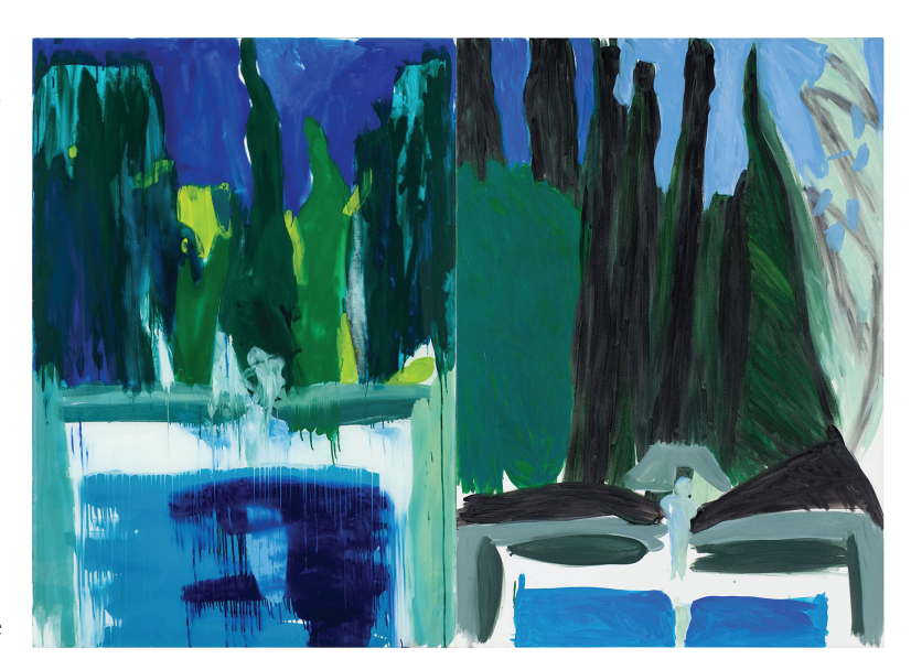
In the Garden III, #5, 1982, enamel on glass and oil on canvas

With In the Garden III , #5, 1982, however, a diptych painted in enamel on glass on the left and oil on canvas on the right, Bartlett accepts the viscosity of the enamel, which drips and runs in streams down the surface of the glass; the statue of the boy seemingly melts into the water below him. In a stark contrast she then pairs the