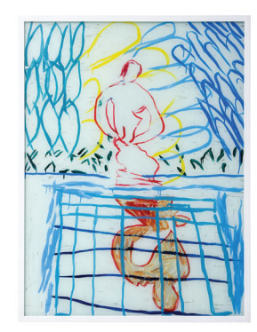
In the Garden II, #1, 1980 oil on canvas, enamel on silkscreened steel plates, pastel on paper, and enamel on glass

place, particularly with her Air : 24 Hours paintings, each showing a new scene in her household at a different hour of the day, and in her more recent diptychs of details from her backyard garden in Brooklyn.