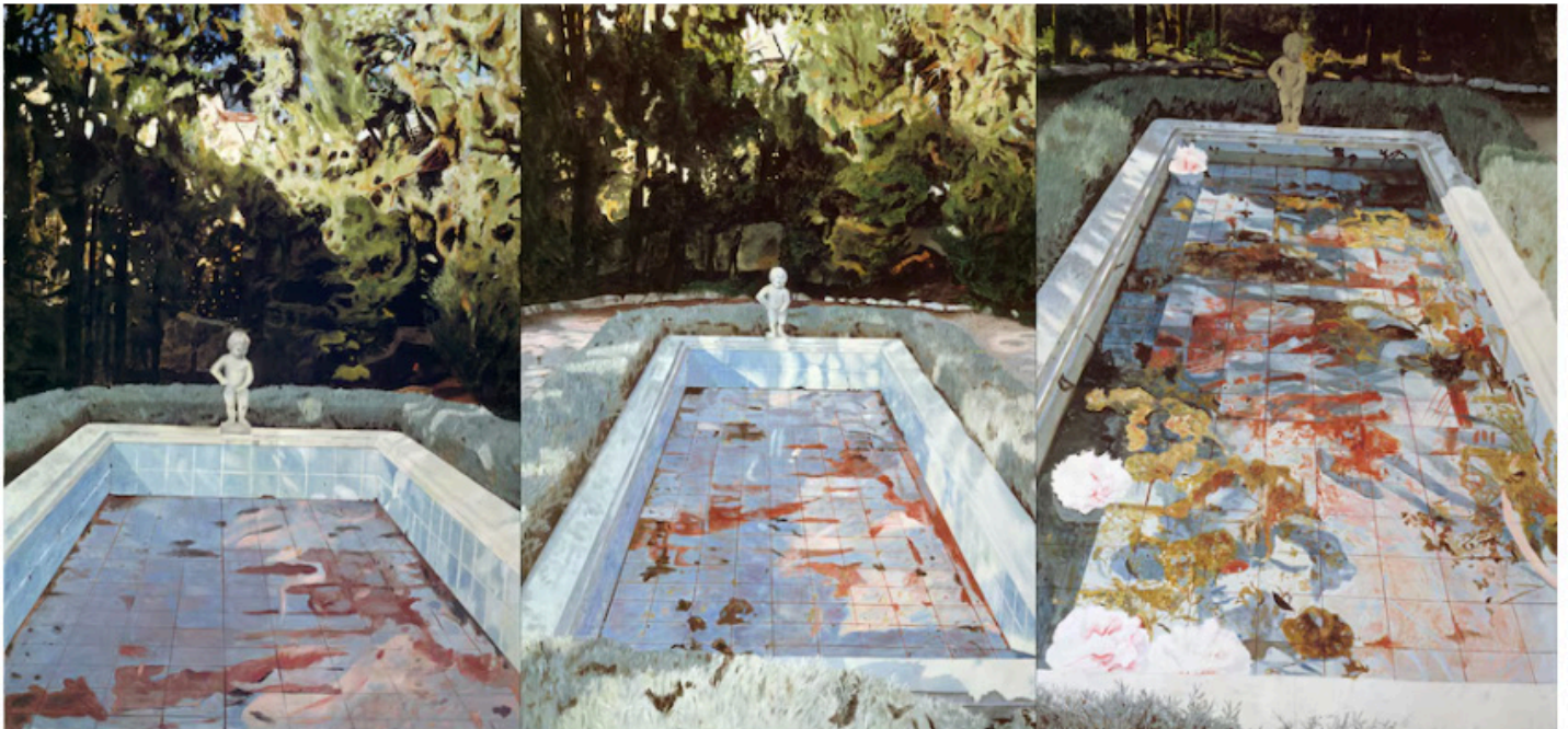
Jennifer Bartlett, "Pool," 1983, oil on canvas.