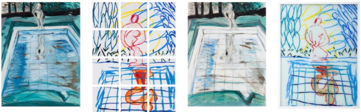
Jennifer Bartlett, “In the Garden II, #1,” 1980, oil on canvas; enamel over silk-screen grid on baked enamel steel plates; gouache on paper; enamel on glass.

Bartlett’s polyglot nature is apparent at first glance. “Wind” (1983), an oil painting spanning five canvases, is an expressionist cycle of menacing cypress trees that resembles a sequence of blown-up film stills. Across the room, “In the Garden II, #1” (1980) comprises a cluster of smaller works on paper, canvas, plate and glass — a fauvist suite of dashed-off compositions. Still another artist might have painted “In the Garden #190” (1982), a grave black-and-white oil diptych, in which representational elements lose their coherence. “In and Out of the Garden” reads as a postmodern group survey, but the work is all Bartlett.