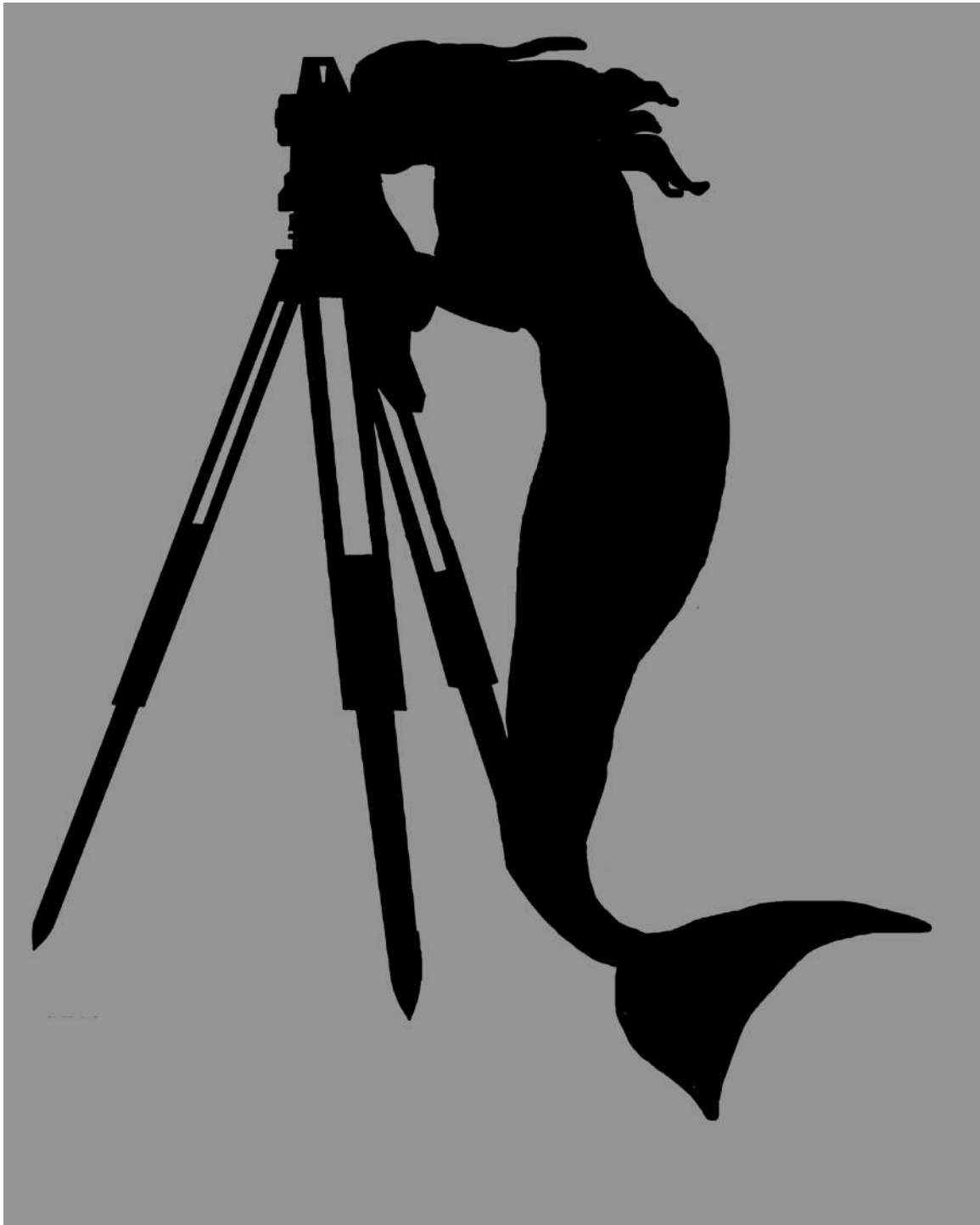
Preliminary Design (detail), Ellen Harvey, 2015