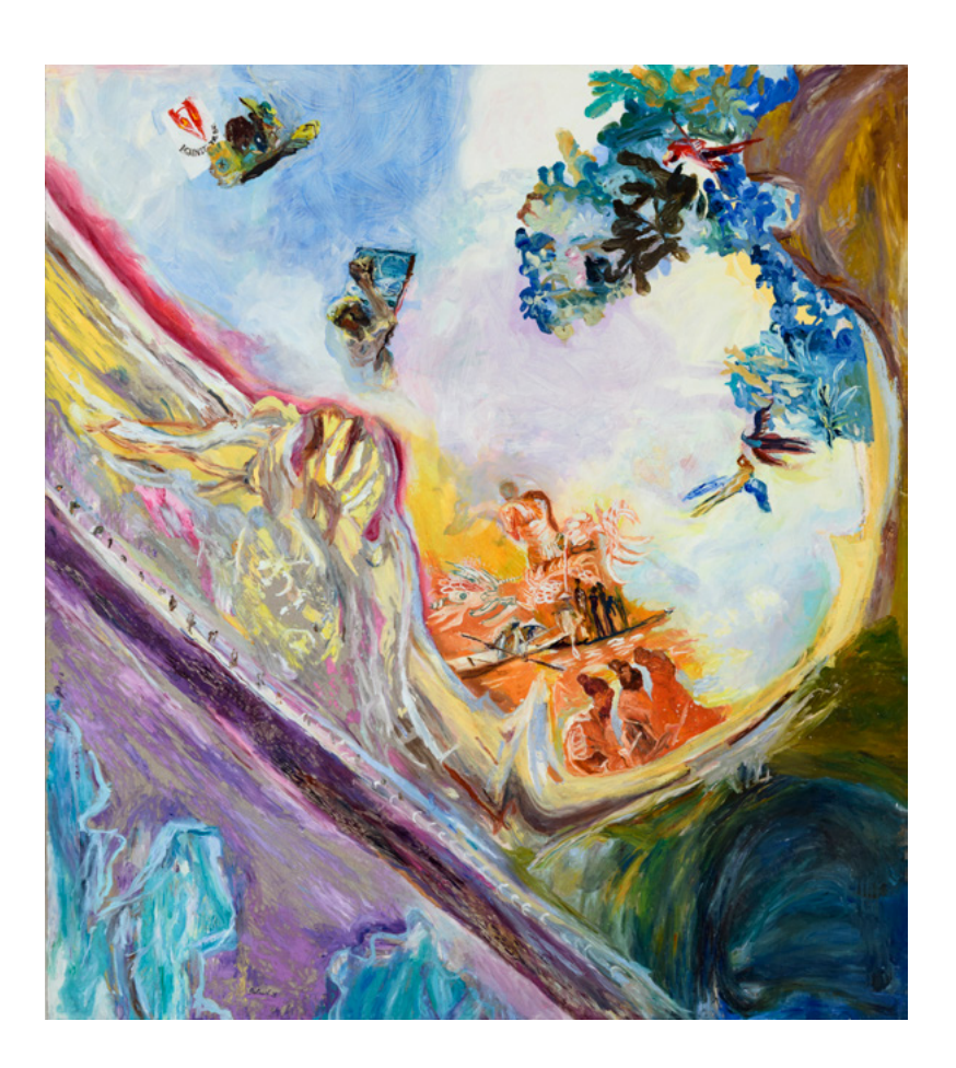
Cosmos 2, 2023, oil on linen with clear geso ground.

violence completely. How do you relate to beauty in all of this?